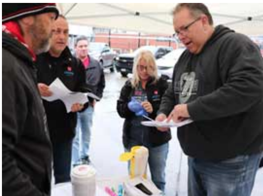
Unifor locals come together to combat COVID-19 and deliver hand sanitizer