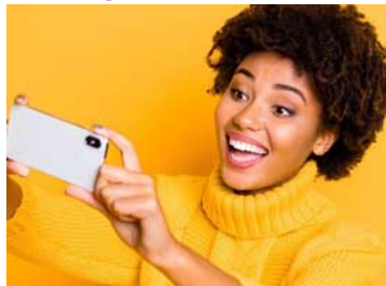
We want to hear from you! Send us a video to let us know how you are coping